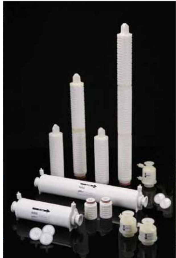
Note: TETPOR is a registered trademark of Parker domnick hunter