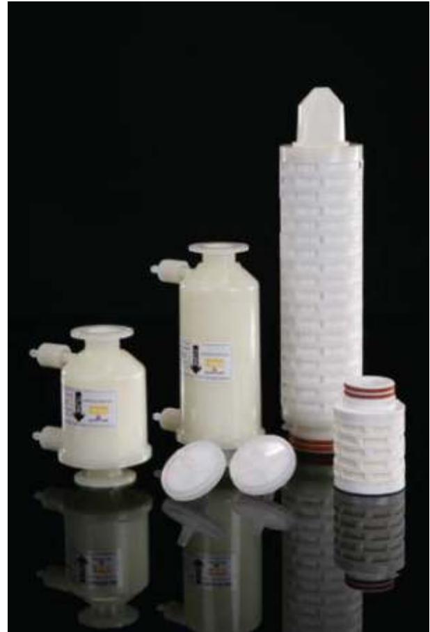
Note: PEPLYN is a registered trademark of Parker domnick hunter