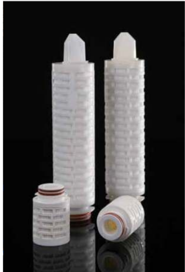
Note: TETPOR is a registered trademark of Parker domnick hunter