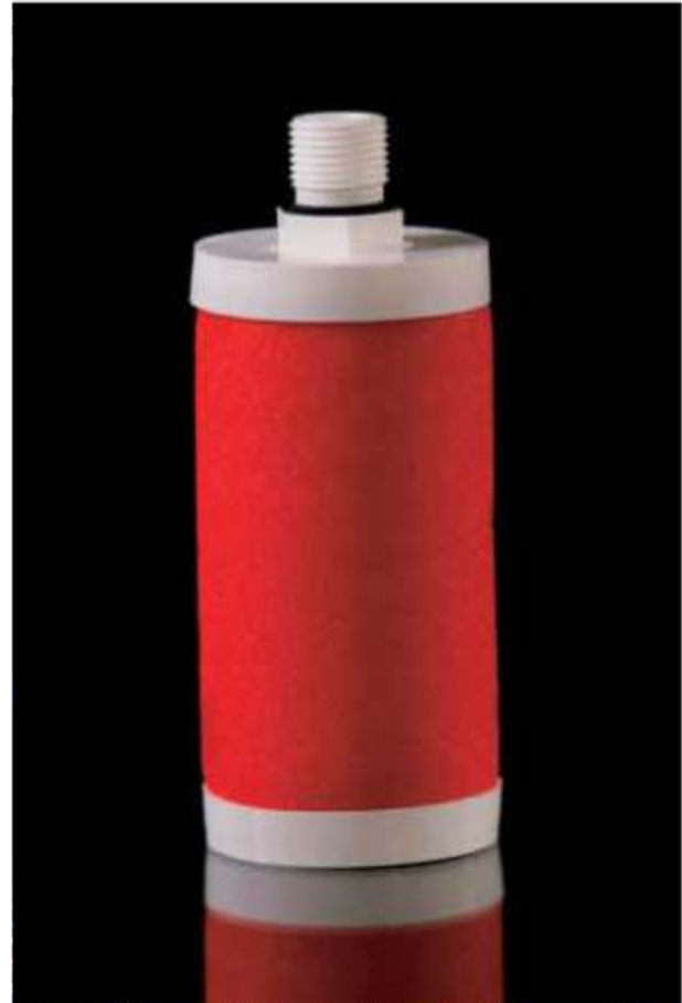
Note: BIO-X is a registered trademark of Parker domnick hunter