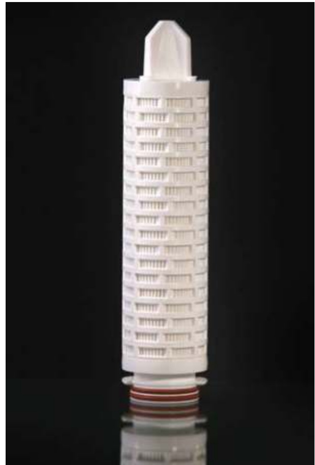
Note: TETPOR is a registered trademark of Parker domnick hunter