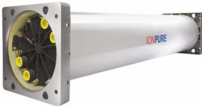
Ionpure® VNX Enhanced Performance High Flow Continuous Electrodeionization (CEDI) Modules